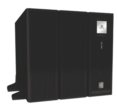
*Shown here the UPS and battery cabinets in a tower arrangement.